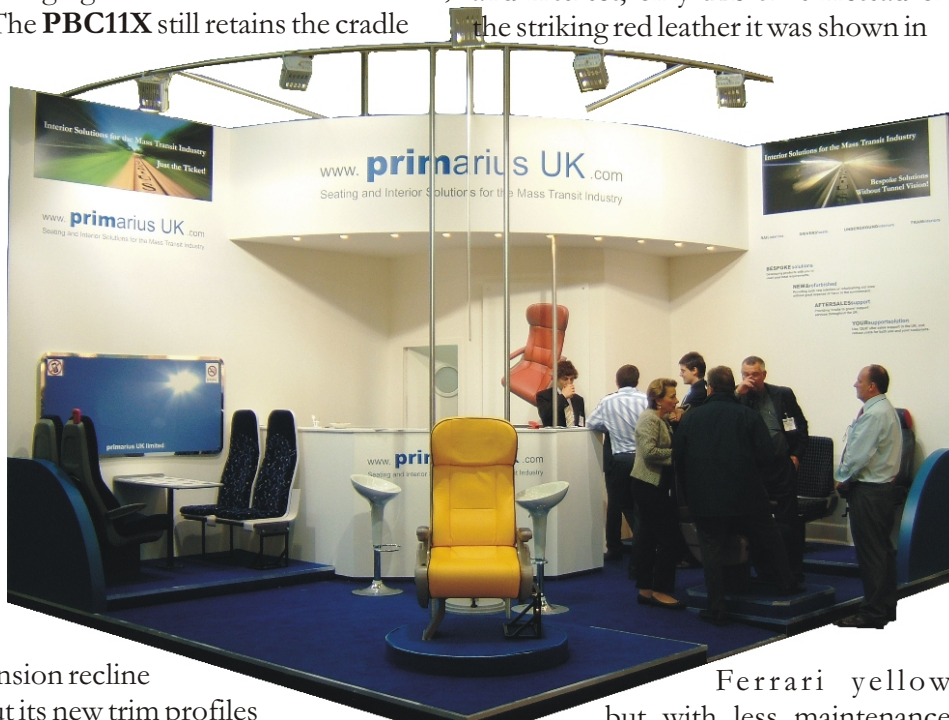
PBC11X First Class

The Primarius first class PBC10X was again on show this year by popular demand having been launched at last year's Railway Interiors Expo and since been the object of many discussions and interest, only this time instead of the striking red leather it was shown in