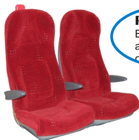
PBC2X Business Class, available in a 2+2 configuration!

At the show, Primarius UK have yet again responded to customer requests by launching two new additions to their already extensive list of seating solutions.